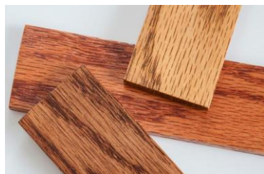
CATHAY- INDUSTRIES_EnvironOxid e_05.jpg

The micronised EnvironOxide ® pigments show excellent transparency, dispersability as well as tinting strength. They are particularly suited for wood coating.